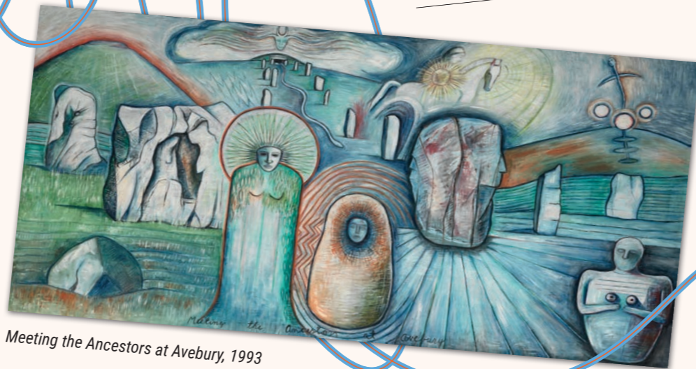
Meeting the Ancestors at Avebury, 1993