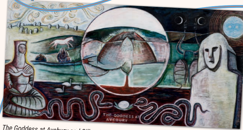
The Goddess at Avebury, 1974, 25x45cm