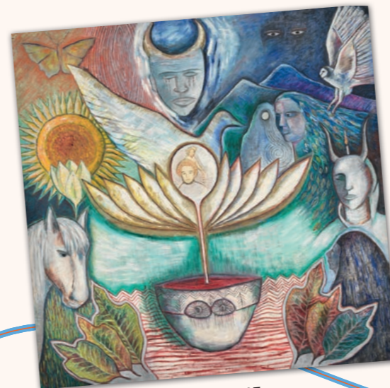
Rebirth from the Motherpot, 1987