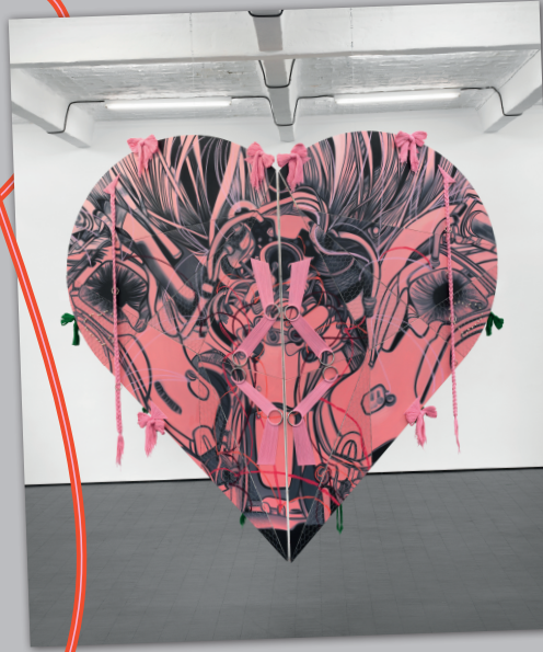
Open your heart because everything will change, 2023