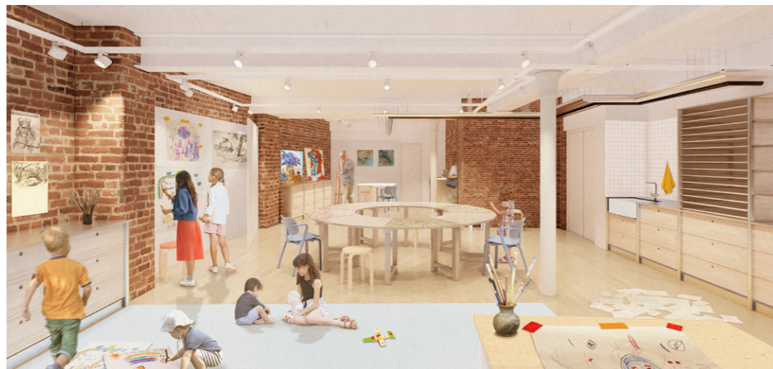
Artist's impression looking through at the extended and refurbished Creative Space showing the indicative alterations including exposed original brickwork, re-opened existing arch, new furniture for working and storage, new unified floor treatment and rationalised lighting design.