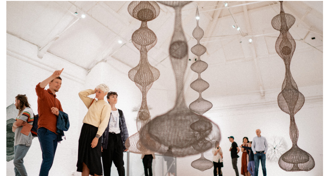
Ruth Asawa: Citizen of the Universe, installation view at Modern Art Oxford, 2022.

Since its foundation in 1965, Modern Art Oxford has brought some of the world's most important, celebrated and often overlooked artists to the city and to the UK, and has championed emerging and under-represented artists. The programme is international in ambition and reach, and is underpinned by partnerships with leading institutions. It features artists from across the globe and contributes to Oxford's standing as one of the world's leading centres for education and culture.