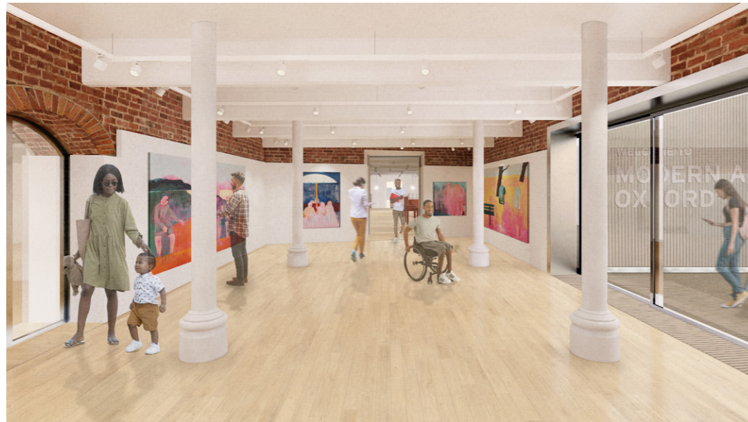
Artist's impression looking through the ground floor gallery from the stair lobby showing the indicative alterations including exposed original brickwork, re-opened existing arch, new unified floor treatment, rationalised lighting design and new wall lining design for art display.

“Modern Art Oxford’s ambitious, meticulously researched and ever-prescient programming has played a fundamental role in shaping the discussion around contemporary art in Britain and beyond. It has introduced the public to a wide range of artists of whom they had never heard, but having seen them, will never forget.” Will Gompertz, BBC Arts Editor (2009-21)