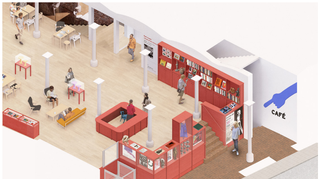
Artist's impression, cut through from Pembroke Street entrance with relocated shop and indicative, new welcome desk and social space seating and activity areas.

As a donor to the project, invested in the future of Modern Art Oxford, we also invite you to consider a three year commitment as a Supporter (Commissioning Circle, Director's Circle or Patron). Your long-term contribution enables Modern Art Oxford to meet the elevated running costs of an ever growing, world-class artistic programme, and ensures the positive impacts of the project are fully realised. Please visit the Support Us page of our website or contact maria.moorwood@modernartoxford.org.uk for further information.