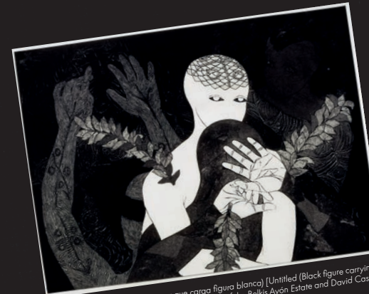
Belkis Ayón, Sin título (Figura negra que carga figura blanca) [Untitled (Black figure carrying a white one)], 1996. © Belkis Ayón Estate. Courtesy of the Belkis Ayón Estate and David Castillo.

There was a short supply of art materials in Cuba so Belkis used what she could get her hands on, including paper, sand paper, cardboard, packaging materials and glue.