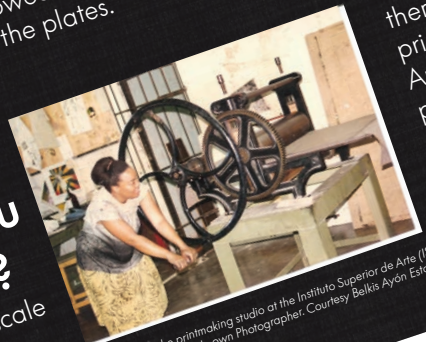
Belkis Ayón in the printmaking studio at the Instituto Superior de Arte (ISA) in Havana, c. 1998.

The only person she allowed to help with her process was her mum, who was allowed to cut out the paper to stick to the plates.