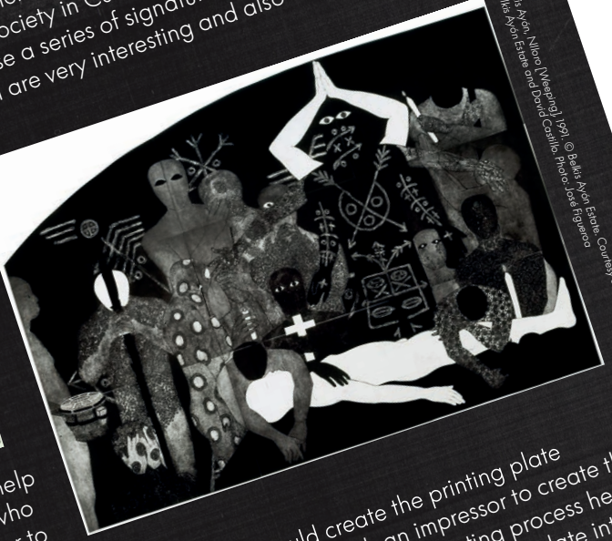
Belkis Ayón: Sikán (Sikán with Goat) [Untitled (Sikán with Goat)], 1993. © Belkis Ayón Estate. Courtesy of the Belkis Ayón Estate and David Castillo. Photo: José Figuerro

The only person she allowed to help with her process was her mum, who was allowed to cut out the paper to stick to the plates.