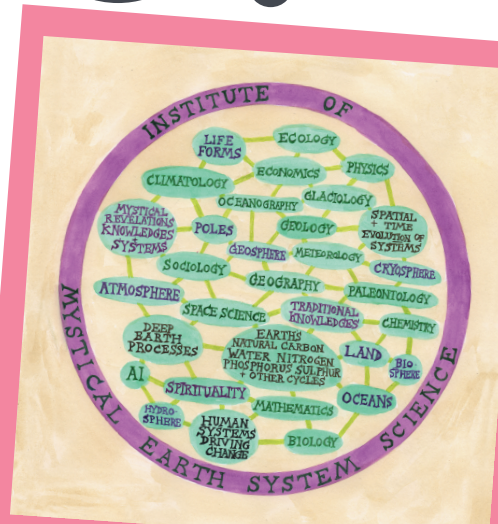
Institute of Mystical Earth System Science Diagram 01, 2004-2005, watercolour on paper