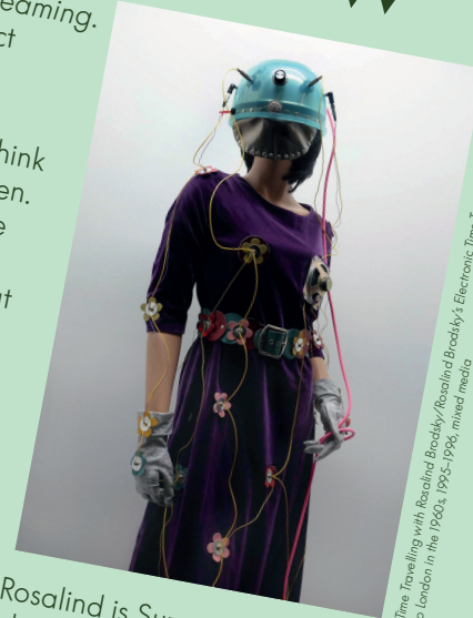
Time Travelling with Rosalind Brodsky/Rosalind Brodsky's Electronic Time Travelling Costume to go to London in the 1980s, 1995-1996, mixed media

Rosalind has her own outfits and keeps a diary of her journeys through time. She often time travels in search of her ancestors, and has even made her own music videos and cookery shows.