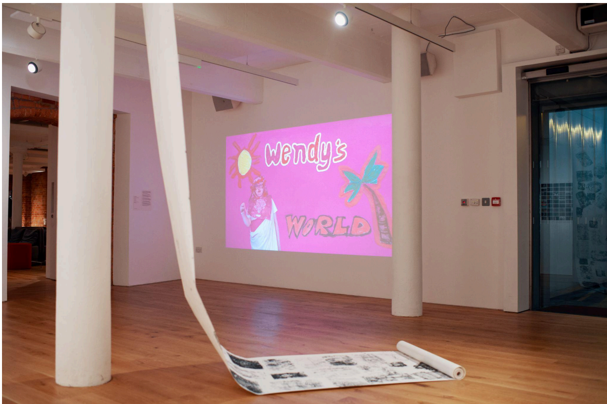
(Image credits: Installation view of We're Going To Need A Bigger Brush! , 2026.)

Please see below some photos of video work exhibited in the space.