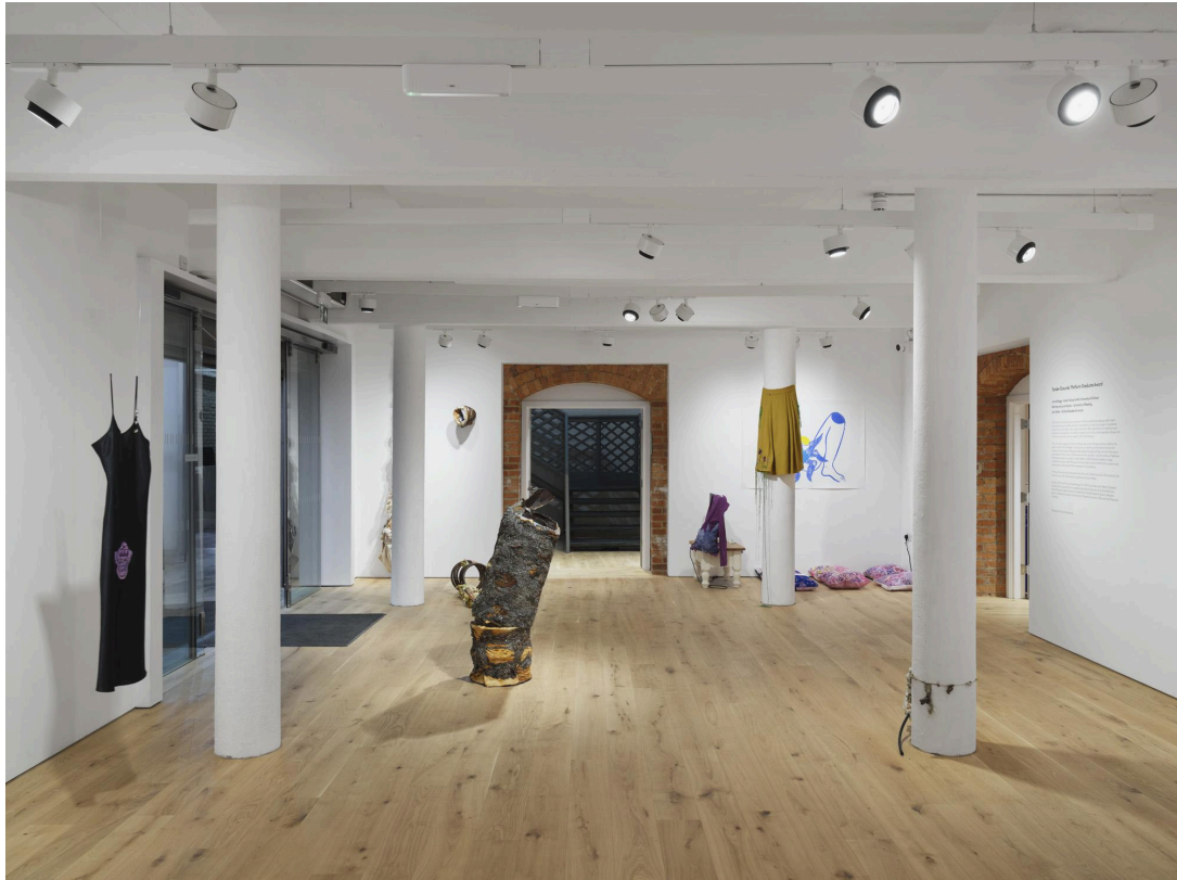
Image credits: Installation view of Tender Grounds, 2024. © Modern Art Oxford. Photo by Ben Westoby.