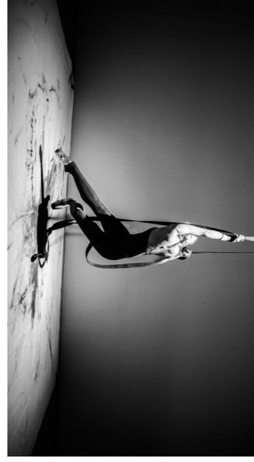
Eve Mutso , loop , 2018. Commissioned by The Fruitmarket Gallery, Edinburgh.

"Art can generate many types of imaginings and solidarities, closing the gap on 'remoteness' in relation to how we think about environmental issues." – Tania Kovats