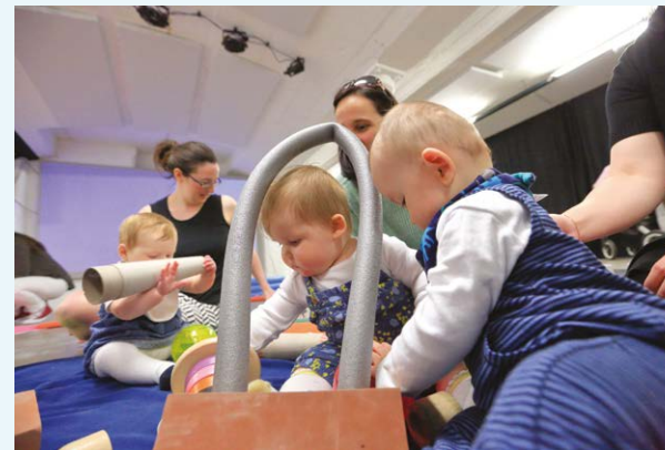
Make Play.

Our activity sheets provide fun and informative activities for children and families that are linked to our current exhibition. Pick one up for free from our Info Desk or Shop.