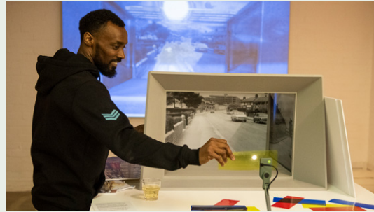
Creative Space, 2018.

Visit our Creative Space to experiment, learn and play every day. At weekends between 12–4pm, members of our friendly team are here to help visitors create their own artworks. This spring discover a changing display of our ongoing project How Nature Builds , which offers creative explorations of nature, material processes and art.