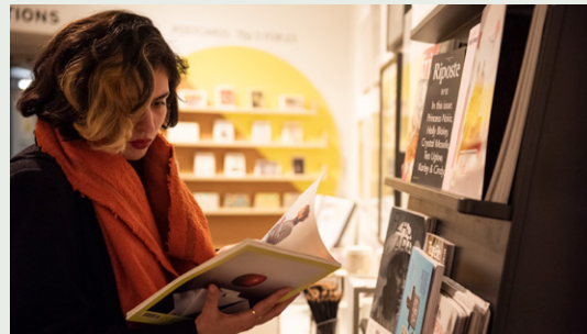
Modern Art Oxford Shop, 2019.

Modern Art Oxford's Shop is the perfect place to pick up unique gifts, art books, toys, jewellery and stunning pieces by local designer-makers. A series of Johanna Unzueta's prints, produced exclusively for Modern Art Oxford, will be for sale in the shop. Their sale helps to support our exhibitions and learning work. Find out more by following @mao_giftshop on Instagram.