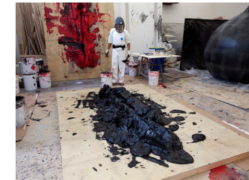
Anish Kapoor studio, 2019.

This unprecedented exhibition of Japanese-American artist Ruth Asawa (b. 1926, Norwalk, California - d. 2013, San Francisco) is the first major presentation of her work in Europe. It showcases her stunning suspended wire-mesh sculptures and celebrates her dedication to art's role in education and society. This exhibition is in partnership with Stavanger Art Museum, Norway.