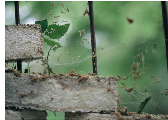
breakTHE DECAY, 2019. Photo of Continuing Bodies , created during How Nature Builds 2018.